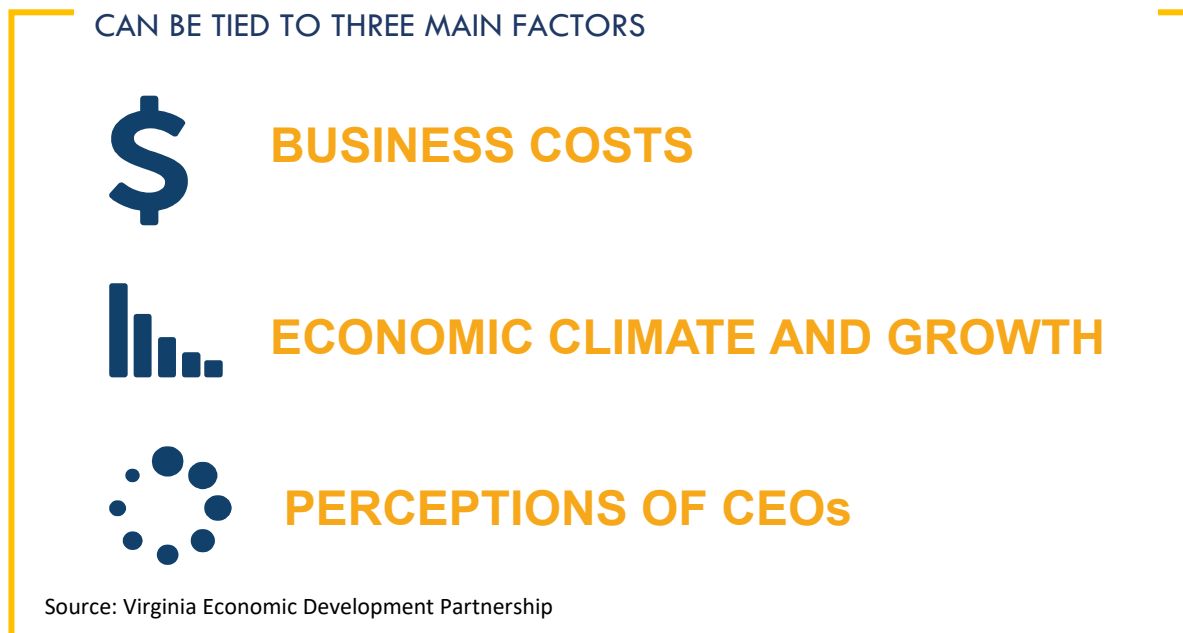
FIGURE 2: VIRGINIA’S DROP IN MAJOR BUSINESS CLIMATE RANKINGS CAN BE TIED TO THREE MAIN FACTORS